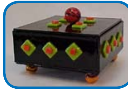
Little Black Box by Tam Johannes Fused glass panels, hand assembled, marble feet & handle